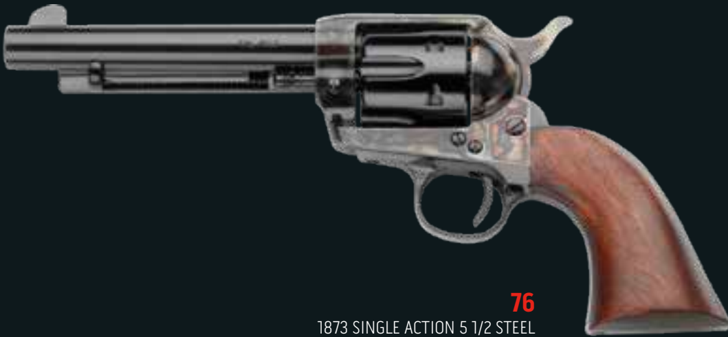
76 1873 SINGLE ACTION 5 1/2 STEEL