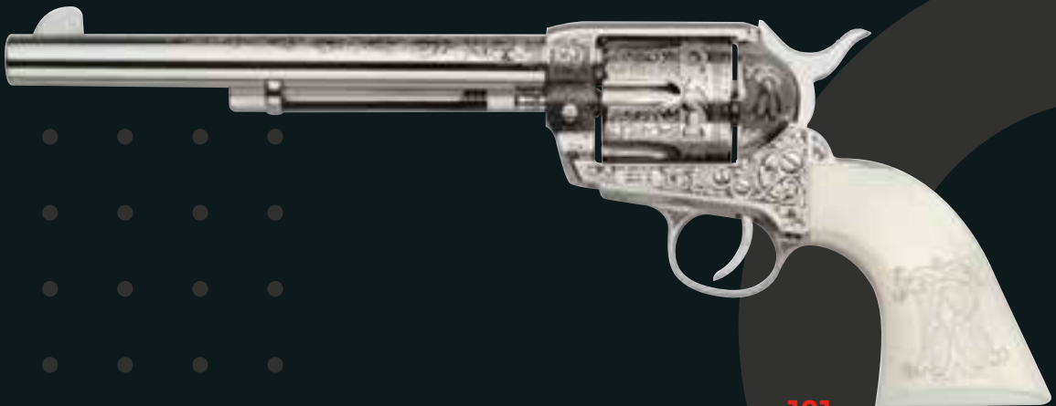
1873 SINGLE ACTION .22LR 10CC, 5 1/2 BLUED