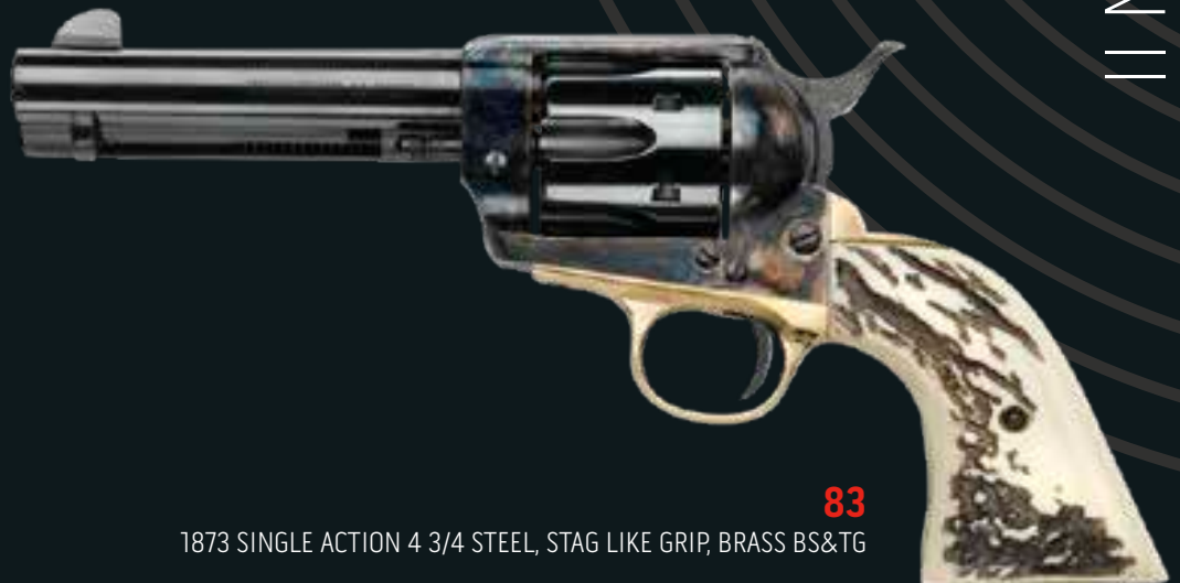
1873 SINGLE ACTION 4 3/4 STEEL, BRASS BS&TG