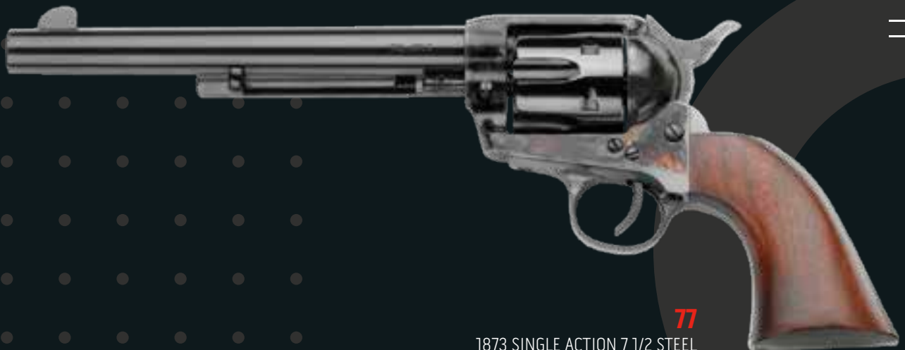
77 1873 SINGLE ACTION 7 1/2 STEEL